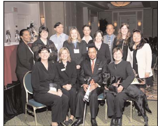
Staff, Sponsors and Award Recipients

Over five hundred business leaders were in attendance at the conference to share and learn about the achievements of the six Virginia companies that received this year's New Freedom Employment Initiative Award as well as all the employees with disabilities who contributed to the success of their companies. The Board congratulates all the award recipients and all the collaborators who made the conference and the awards ceremony an inspiring event, especially the Virginia Business Leadership Network, SunTrust Bank, and the Virginia Society of Human Resource Management. These organizations are networking, training, and modeling successful employment practices that demonstrably improve the hiring and retention of people with disabilities in Virginia's workforce. Successes achieved through improved corporate attitudes and expanded hiring and accommodation policies should be celebrated everyday. ♡