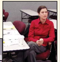
Richmond workshop participants and Board staff discuss proposal submission procedures for upcoming grant initiatives.