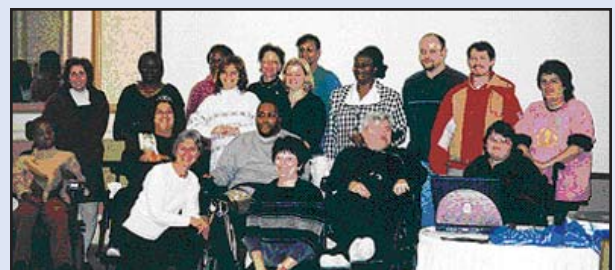
New Voices Planning Team

A conference to discuss topics identified by people with developmental disabilities as being important to the way they live their lives. Issues identified for the Our Lives, Our Voices! conference include: housing, transportation, employment, attendant care, post-secondary education and assistive technology. Invited guests include people with disabilities, providers, agency leaders, legislators, policy makers and others. A post conference monograph highlighting conference events, discussions and systems change recommendations will be developed and distributed in early 2006. ♡♡