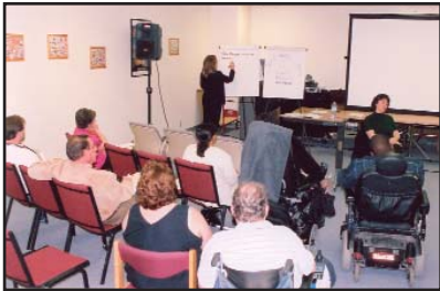
Forum attendees discuss report

Public forums held throughout Virginia between April and June provided opportunities for disability constituents to comment on the interim draft of the Board's first, formal "2005 Biennial Report on Services for People with Disabilities in Virginia." Centers for Independent Living in Tidewater, Northern Virginia, Central Virginia, the Shenandoah Valley and Southwest Virginia hosted the forums which were attended by consumers, family members, service